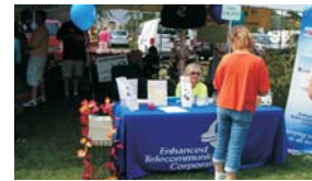
Batesville Apple Festival