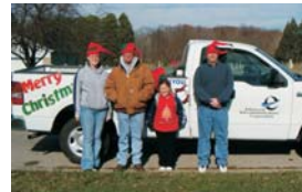
Sunman Holiday Parade